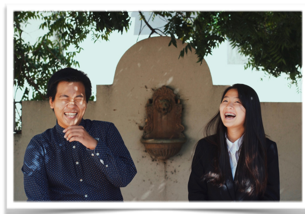
SLED's 2019 Summer Math Coaches.