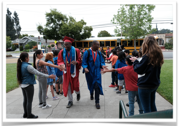
Graduates return to Washington Elementary for the annual SLED supported "K to A thru G Parade"