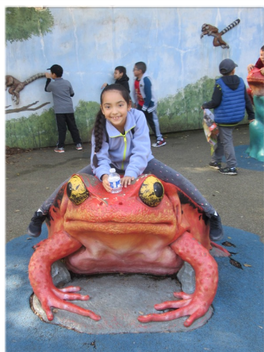
Jefferson 1st grader at the Oakland Zoo .