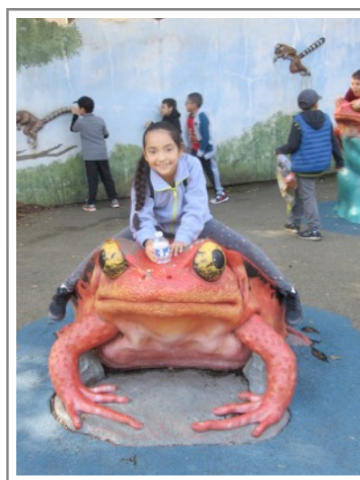
Jefferson 1st grader at the Oakland Zoo .