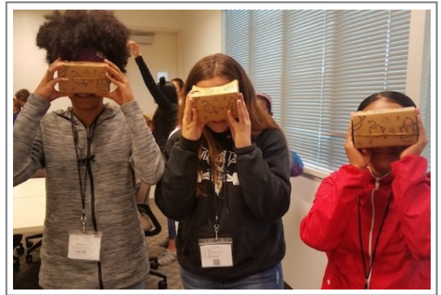
Bancroft girls experiencing virtual-reality technology at GIFT Day 2019.

Fiscal Year 2019-2020 looked like it would be just another year at SLED. We were growing steadily and the feedback we were getting about the programs we were funding was enthusiastic. We