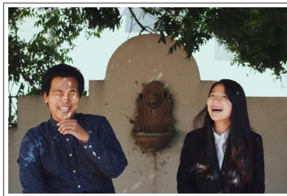
SLED's 2019 Summer Math Coaches.